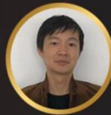
SHARP YE Community Manager, China